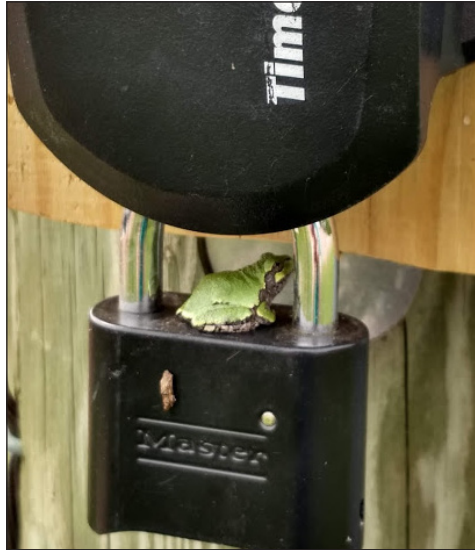
Last fall, TimePilot customer Contemporary Homes, LLC, in Medford, Wisconsin, found a tiny visitor on its Extreme Blue padlock.

Ready to do it? Here's how: https://timepilot.com/newsletter/articles/Issue47.htm