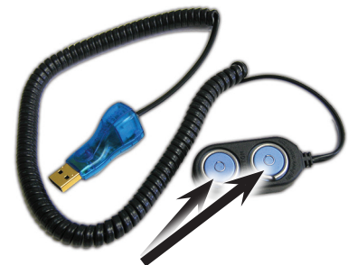
Blue Dot Receptor. You can touch your iButton to either of the two blue probes.